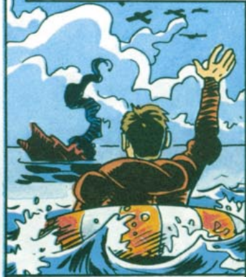
THE WOUNDED, SICK AND SHIPWRECKED AT SEA