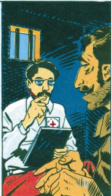
VISITING PRISONERS OF WAR AND POLITICAL DETAINEES