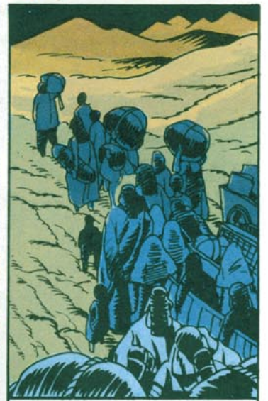
CIVILIANS IN TIME OF ARMED CONFLICT

AND TWO ADDITIONAL PROTOCOLS WHICH SUPPLEMENT THEM: