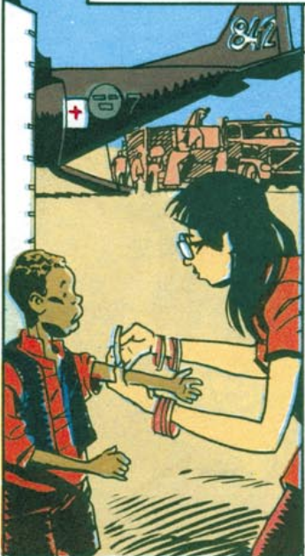
BRINGING RELIEF AND MEDICAL ASSISTANCE TO CIVILIANS

AS FOR THE INTERNATIONAL COMMITTEE OF THE RED CROSS (ICRC), IT HAS GREATLY DEVELOPED IT STILL SPECIALIZES IN HELPING THE VICTIMS OF ARMED CONFLICT.