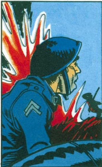
THE WOUNDED AND SICK IN THE FIELD