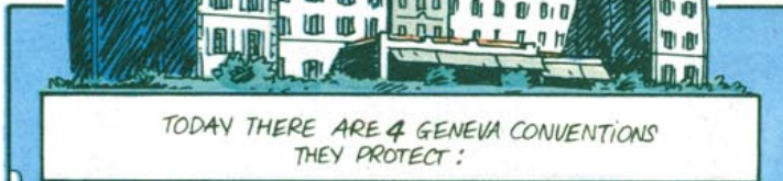
TODAY THERE ARE 4 GENEVA CONVENTIONS THEY PROTECT: