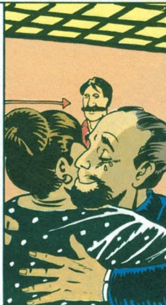
FORWARDING FAMILY MESSAGES AND REUNITING FAMILIES