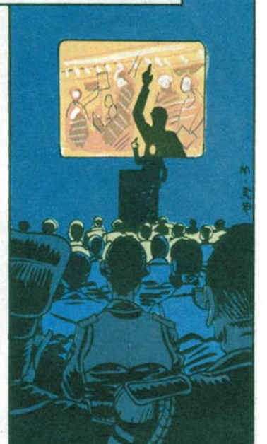
TEACHING THE RULES OF THE GENEVA CONVENTIONS AND THE RED CROSS AND RED CRESCENT PRINCIPLES.