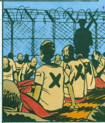
PRISONERS OF WAR